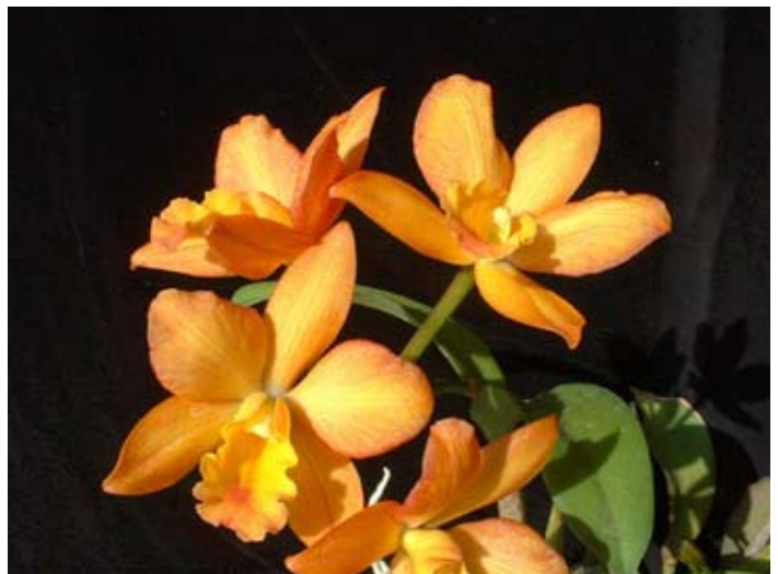
Bc "Rainbow's End" x "Kauai Starbright" "Vi" Ginger and Mel Ochs