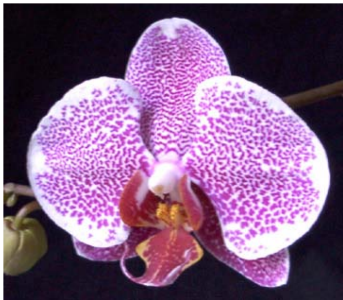
Phal. Cassandra x Phal. (Carmela's Pixie x Fantastic Stripe)