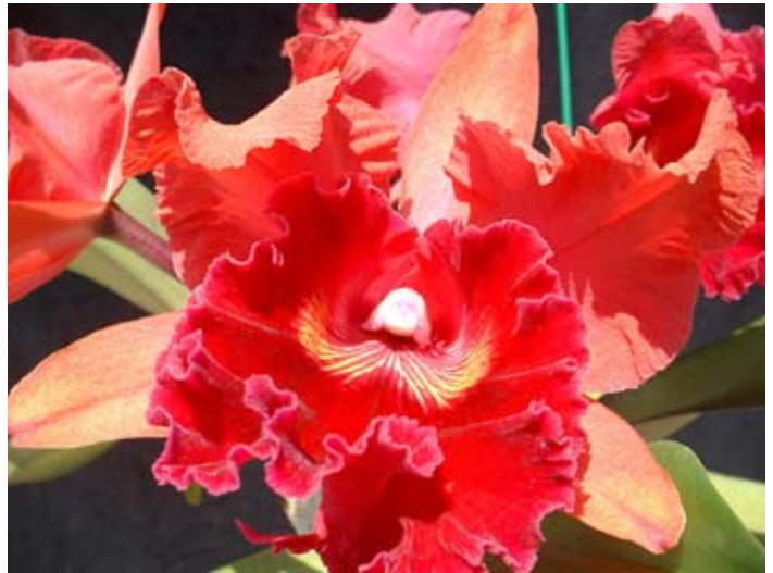
Orchid Potinara San Damiano 'Halona' Ginger and Mel Ochs

Keep in mind these flowers are not similar in size, they just fit better in the columns that way! These pictures are in color if you are reading the electronic version!