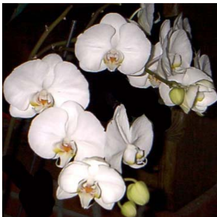
unknown Phal ($5 discard from Vons)

Your membership supports our plant and animal collections and includes a monthly visit to our orchid collection on the third Friday from 10am until 2pm