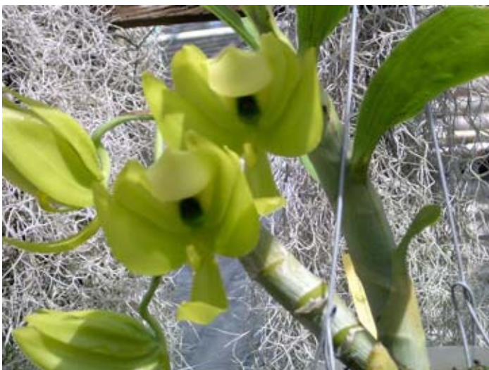
Bud Close Cygnoches chlorochlin (swam orchid)

This is a very unusual size flower for this line-bred species, Mike. When I took it to the species meeting the first of September, it was only in bud. Overall size of flower is 5". Bud Close.