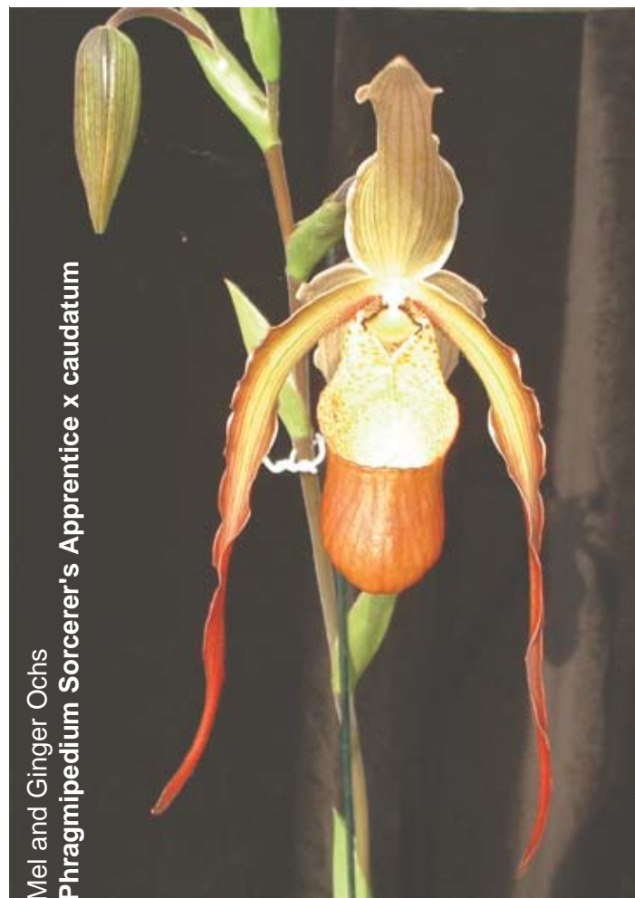
Mel and Ginger Ochs Phragmipedium Sorcerer's Apprentice x caudatum